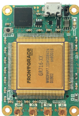
50 x 35 mm, Scale 1:1

The evaluation board is ideal for rapid software development.